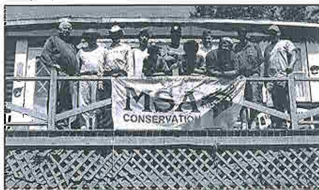
First Class MSA participants