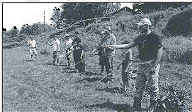
Participants practice casting on dry land first.

Saturday morning got off to a terrific start as we greeted five pairs of mentors with their apprentices at the Atlantic Salmon Museum in Doaktown. Two pairs included individuals from the Big Brothers chapter of Fredericton. One of the mentors had fished before, albeit was eager to learn more; the other had never had a fly rod in his hand. Truly an amazing experience to see how all of them took to the exercise with such zeal and enthusiasm! Three other pairs included two of our own members, one with his 14 year old grandson, the other with his 9 year old nephew.